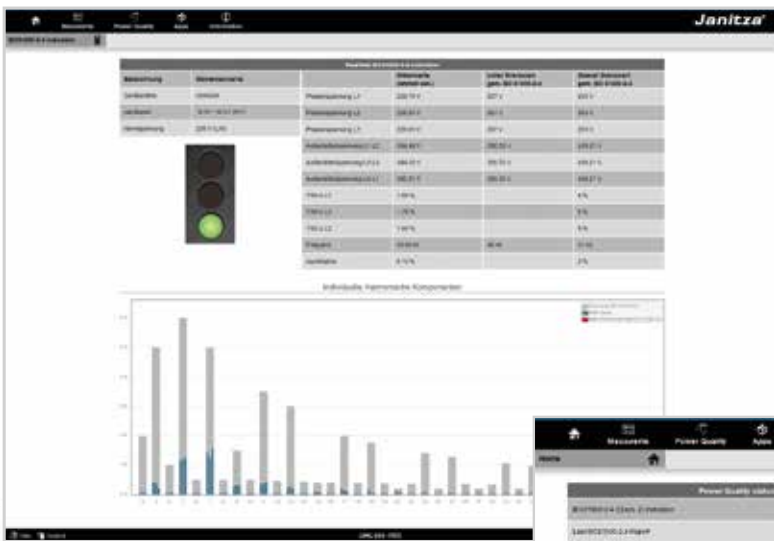
Fig.: IEC 61000-2-4 analysis with traffic-light principle